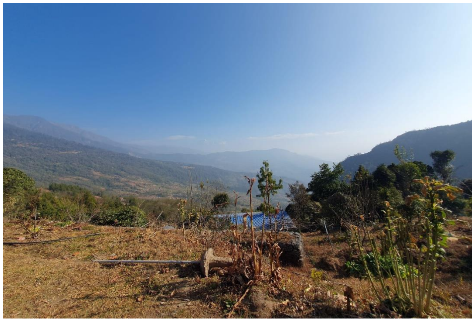
The view from the Mountain Resort in Dolakha (Les Terrasses)

The financial situation of the volunteers should not under any circumstance be an obstacle to a participation to the programs. It is self-evident that the private costs of the trip must be covered in one way or the other. Our program does not only target wealthy people. We advise the future volunteer to mobilize his close environment (family and friends), to organize events, to contact local institutions (clubs, scouts, organizations).