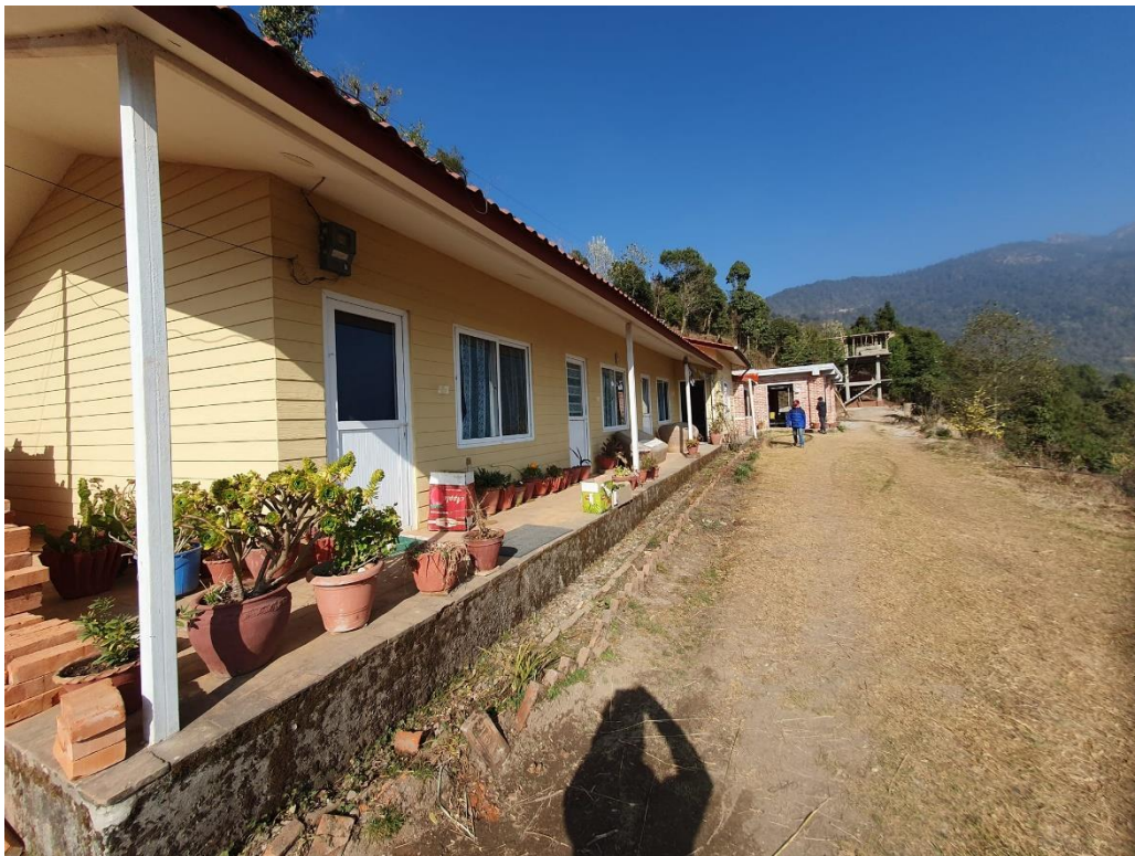
Les Terrasses – Resort (In Dolakha) (formal opening from October 2023)